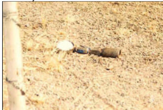
Figure 2. Bull plug, needle valve and gauge assembly

Before the incident occurred, the wireline crew had made one run into the well and had pulled back out of the well to change tools. At approximately 10:30 a.m., while the wireline crew was changing tools near their truck, the well operator and the chemical company operator attempted to gauge the well pressure (later estimated to be approximately 1400 psig). The chemical company operator inserted a gauge assembly, consisting of a bull plug, needle valve and pressure gauge, into a threaded flange on the wellhead and tightened the assembly until it was snug. The well operator, who had been in his truck using a mobile phone, came back to the wellhead, noticed that the gauge rigging was in place, and proceeded to open the gate valve to conduct the pressure check. The wireline crew trainee was standing next to his crew truck approximately 15 feet from the wellhead in direct line with the wellhead connection (Figure 1). When the gate valve was opened, the sudden pressure dislodged the bull plug and blew the plug, needle valve and gauge assembly out of the flange in the direction of the wireline operator trainee, striking him in the head and neck (Figure 2). The force of the impact knocked the trainee into the wireline operator who had been standing a few feet away.