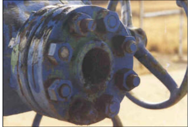
Figure 3. Wellhead Connection

After the incident occurred, the well operator called 911 and an ambulance crew was dispatched from the nearest town, approximately 10 miles from the site of the incident. The victim was transported to the local hospital where he was given life support and trauma care to the extent feasible at the hospital. The victim was later transported by helicopter to a trauma center for more advanced care, but he was pronounced dead approximately eight hours later.